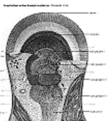
Click images for enlarged views.

The crayfish eye. Arthropod compound eyes are composed of thousands of repeating units called ommatidia . Each ommatidium is a long tube with a cluster of photoreceptor cells at its base. Light enters the top of the tube to reach the photoreceptors. In dark-adapted eyes, some light also reaches the receptors in neighboring ommatidia. Axons from the photoreceptors go to the first of four optic ganglia in the eyestalk. The last optic ganglion sends axons in an optic nerve to the brain. In our experiment, we will place a pin electrode through the corneal surface, attempting to keep it above the receptor cells. In that way, we record the depolarization of the photoreceptors without also picking up responses from neurons in the optic ganglia.